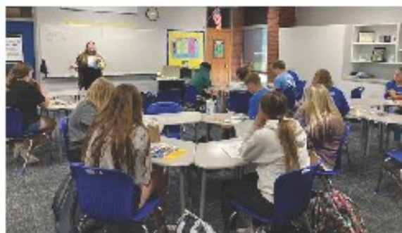
University of Nebraska- Kearney (left)